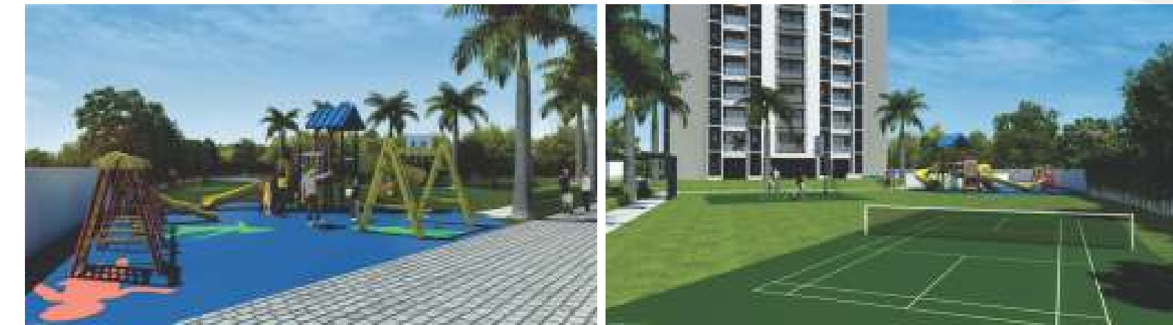
Outdoor Amenities: Swimming Pool • Children's Play Area • Badminton Court • Basket Ball Post • Party Lawn

The moment you enter the gates of Jains Aashraya you can feel a true sense of seamless integration between luxury living and indulgent relaxation. Featuring sweeping panoramic city views beyond compare, this exceptional residential haven boasts of an alluring selection of lifestyle leisure facilities for the entire family. An extensive party lawn overlooking a sprawling children's play area and an ornately landscaped garden adds colour to your lifestyle.