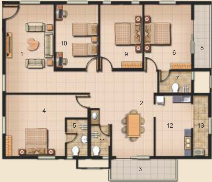
2343 Sq. ft. West Facing