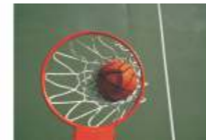
Basket Ball Post