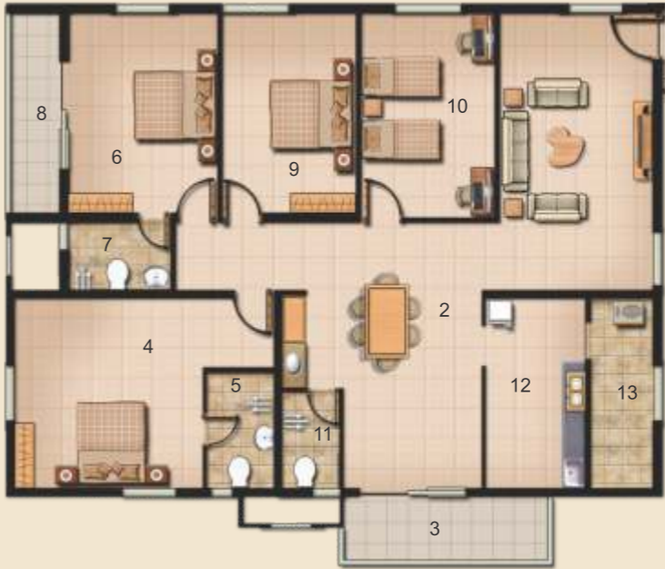
2343 Sq. ft. East Facing