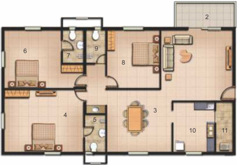
2315 Sq. ft. East Facing