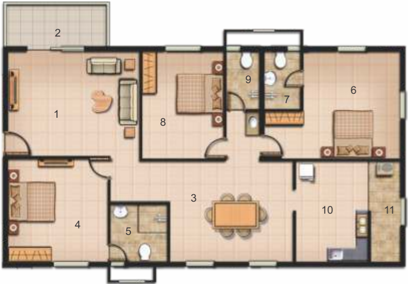
2315 Sq. ft. West Facing